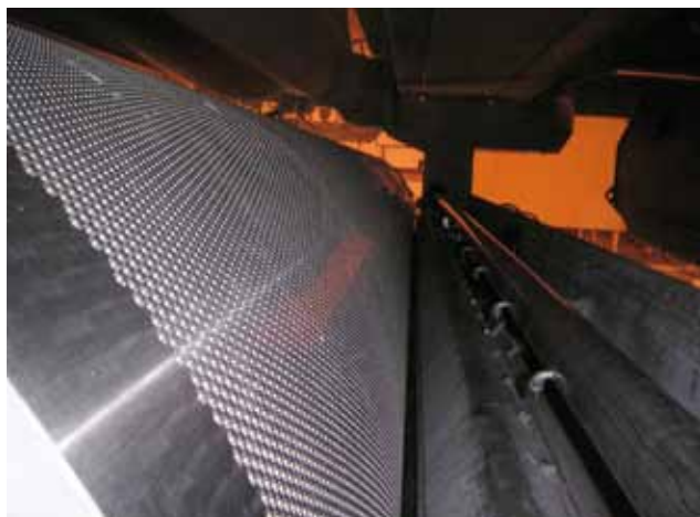
Forming section forming roll before and after cleaning system installed