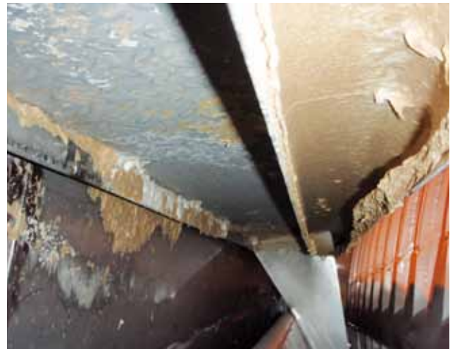
Open areas and surfaces: slime cause unhealthy and even dangerous conditions

Generally, paper makers are using chemicals and biocides to eliminate microbes. Chemical usage is easy but also an expensive way to maintain cleanliness. Often costs of the chemicals are higher than the investment costs. Furthermore, microbes get used to chemicals rapidly leading to the fact that chemicals need to be changed very often. Paper making process is disturbed during the change of chemicals leading to runability problems and production time loss.