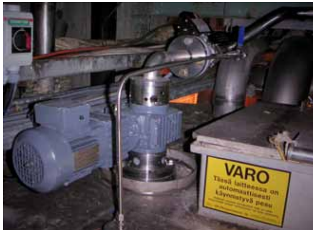
2-stage driving unit

Washing bar of the channels and towers rotates 360 degrees in both directions (number of units depends on area to be kept clean.) A unique type of connection between washing bars ensures flexibility to reach all areas.