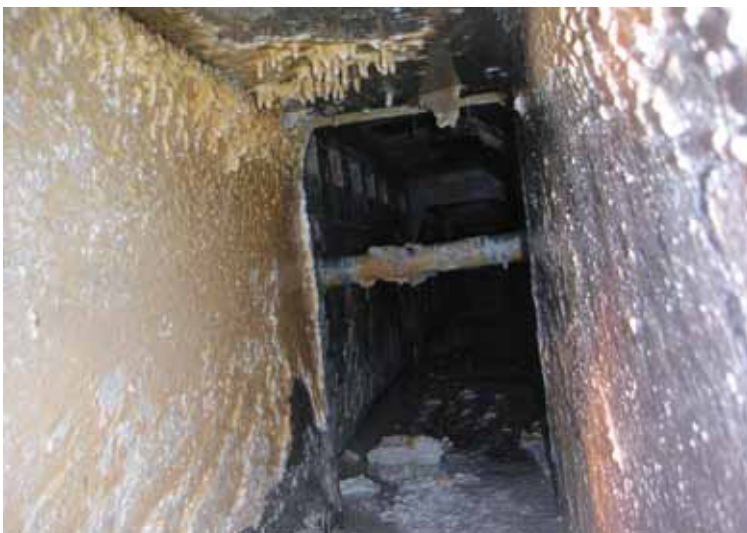
Tanks and towers: slime and bacteria growth above the surface

Accumulations in channels may even cause blocking. Tanks and towers are sensitive to build up slime. Slime causes unhealthy and even dangerous conditions on open areas and surfaces. It risks safety in the mill because surfaces are slippery.